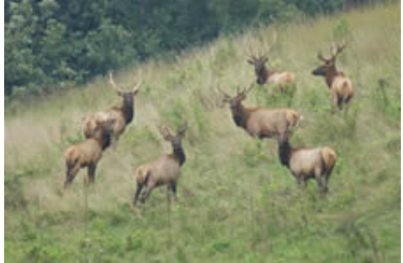
The Elk Foundation helped support Virginia's Operation OUTDOORS, a mentoring program giving 2nd through 6th grade boys who do not have a strong male role model a chance to learn archery, rifle shooting, and the basics of fishing.

Browse the enclosed invitation to learn more about some of the exclusive Elk Foundation merchandise you'll see there.